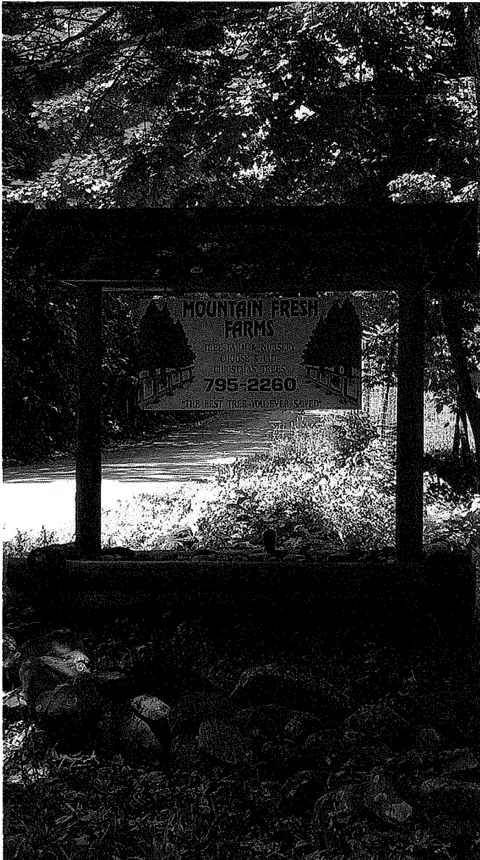
Existing Roadside Signage to Remain

A NY State Certified Women's Business Enterprise, a US Disadvantaged Business Enterprise and a NY City Certified Women's Business Enterprise