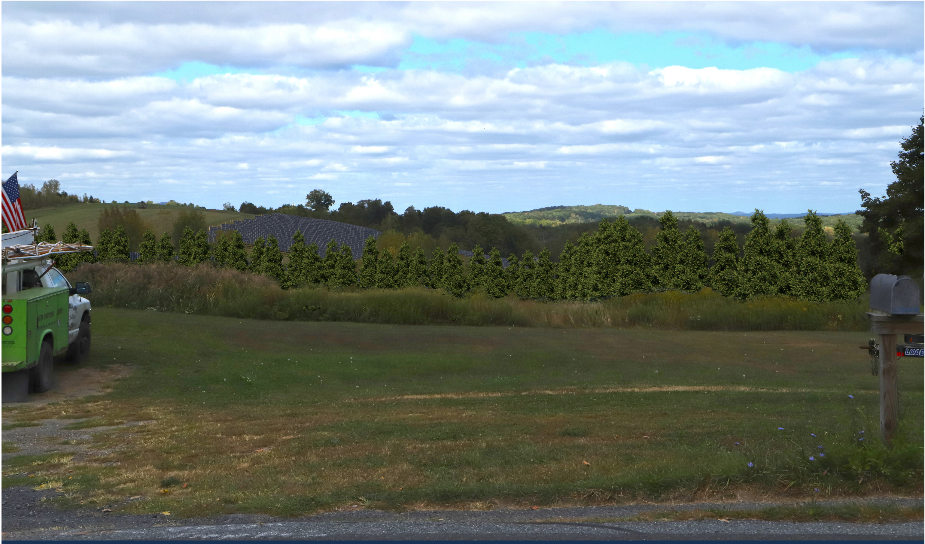
SIMULATED CONDITION - With Landscape Mitigation (At Year 5)