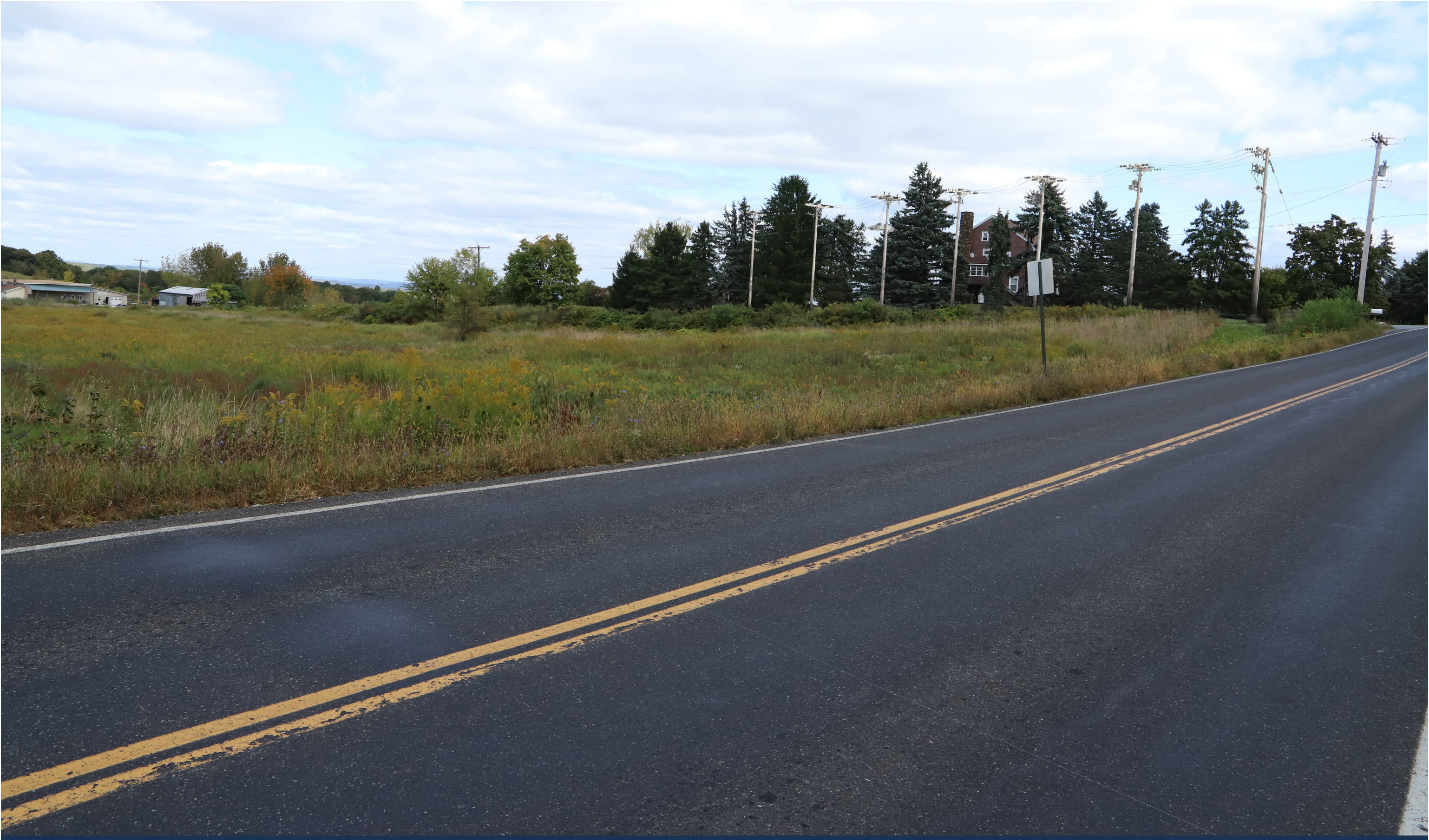
SIMULATED CONDITION Photo 2: Milton Turnpike near #235 Distance to project: 530 Feet

Date: September 24, 2024 Time: 1:55 PM Focal Length: 24 mm Photo Location: 41° 39' 59.4720" N, 73° 58' 43.1040" W