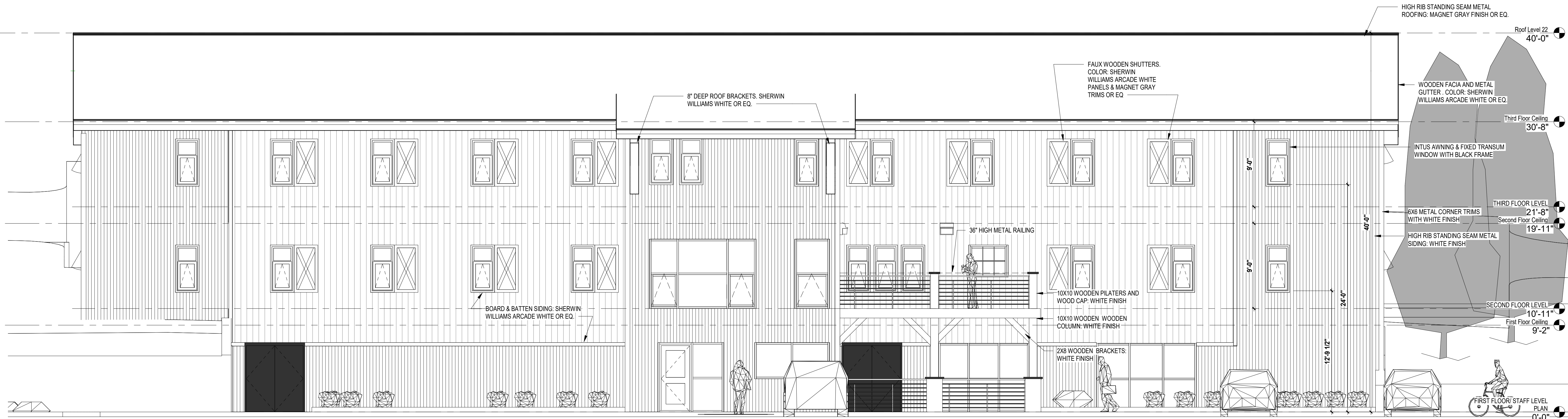
EAST ELEVATION - LOWER PARKING LOT 3/16" = 1'-0"

MARLBOROUGH RESORT - STAFF HOUSING 626 LATTINTOWN ROAD, MARLBOROUGH, NY 12542