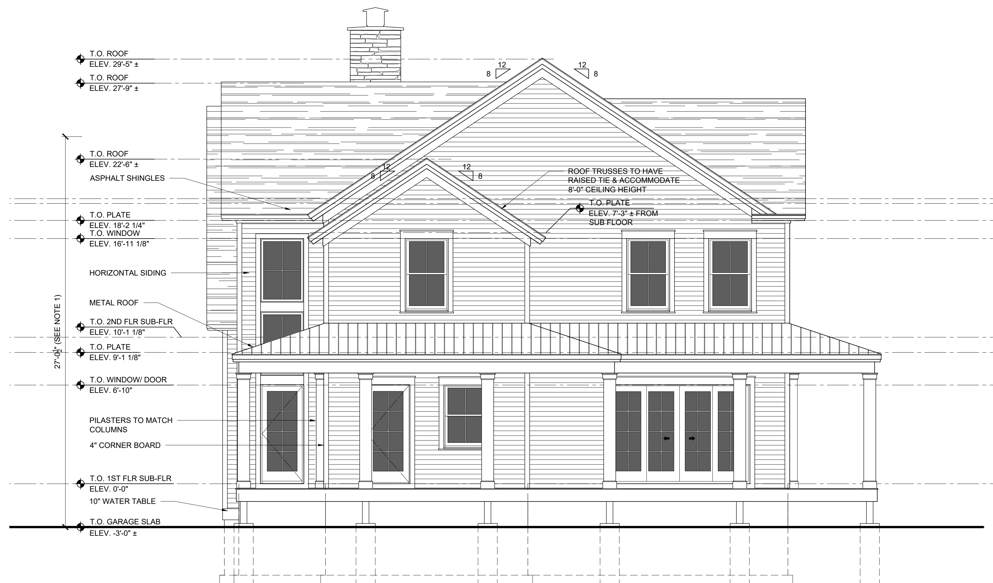
2 SOUTH ELEVATION