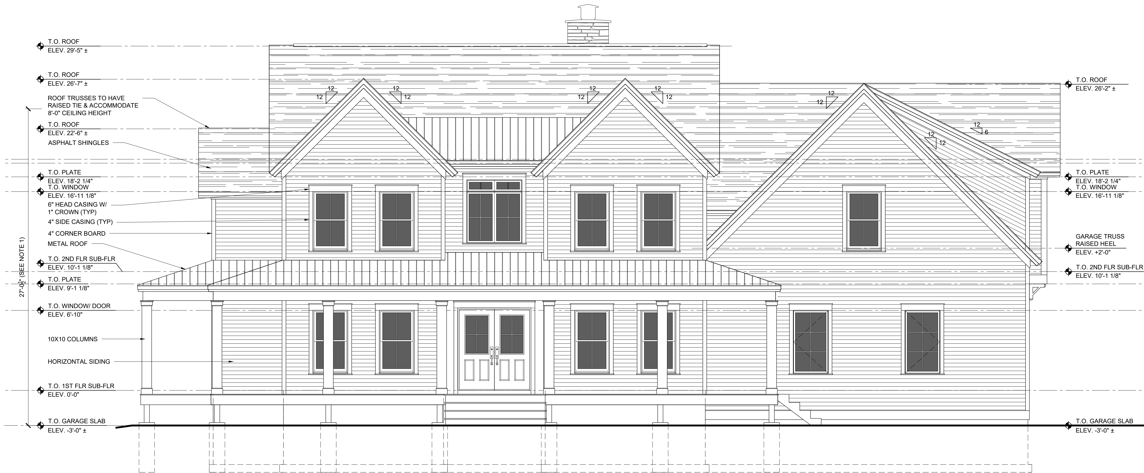
1 EAST ELEVATION