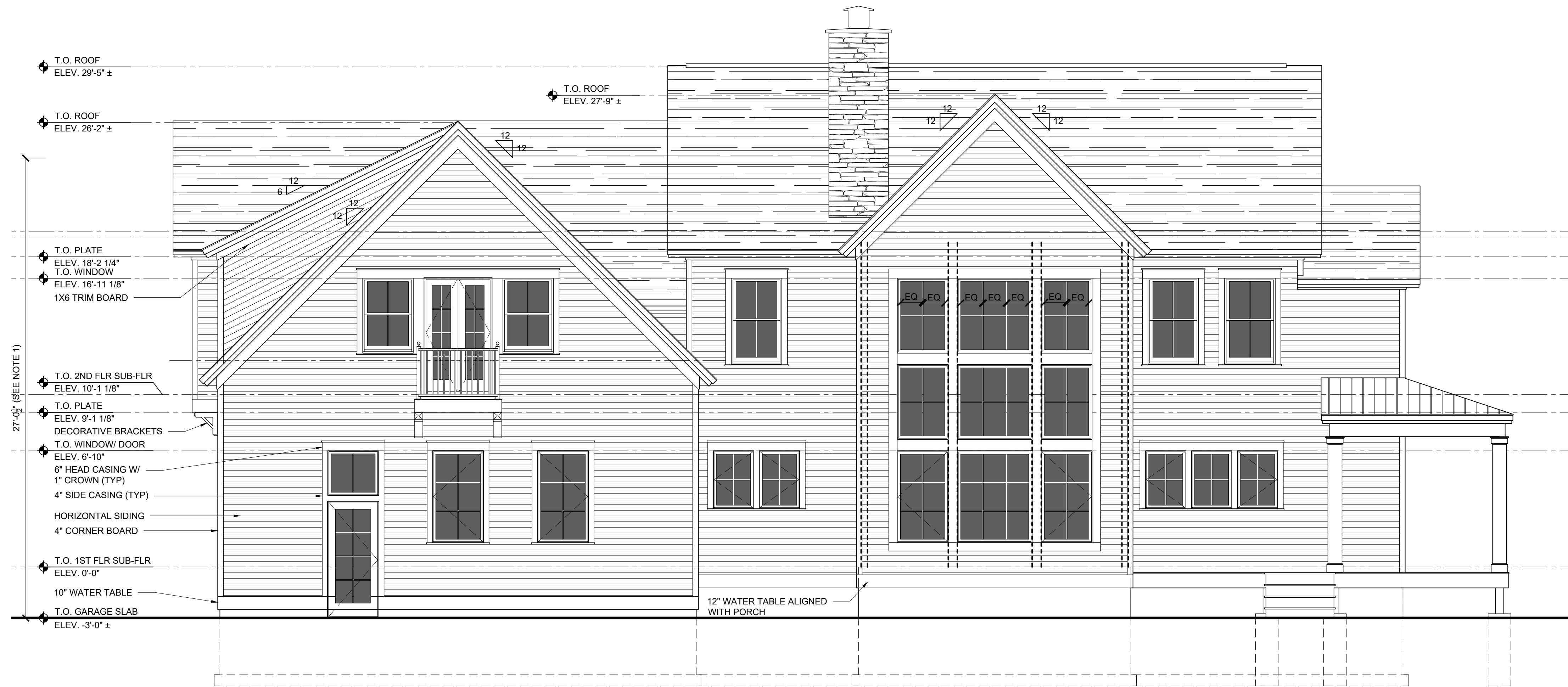
1 WEST ELEVATION